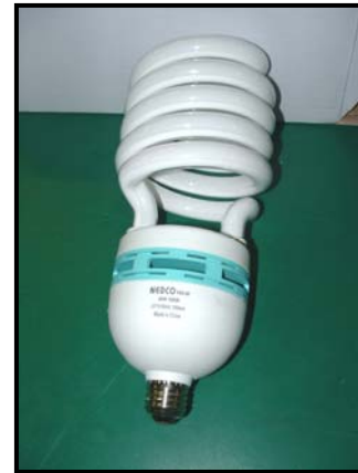
New 80-watt CFL