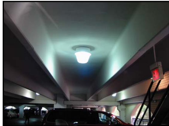
New CFL fixture