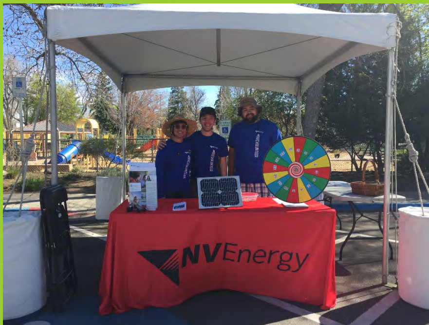
Reno Earth Day 2018 at Idlewild Park Reno, NV