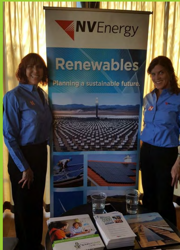
NV Energy RenewableGenerations Staff at an event at the Nevada Museum of Art in Reno