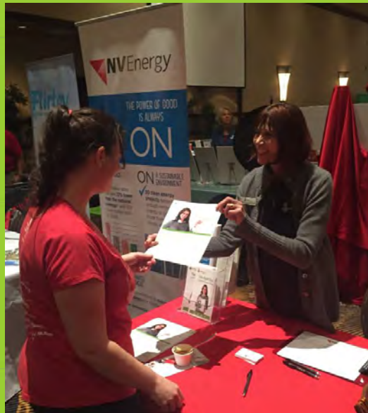
Go Red for Women Luncheon Reno, NV