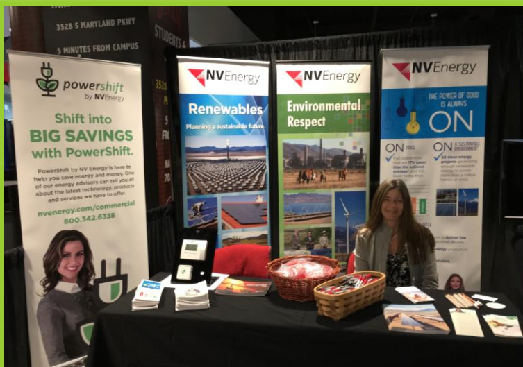
Las Vegas Preview.....