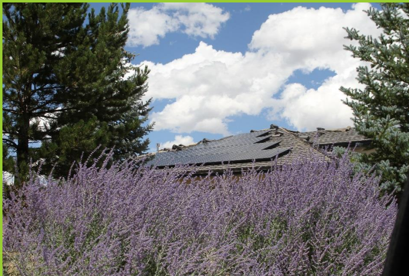
Residential Solar Installation in Reno