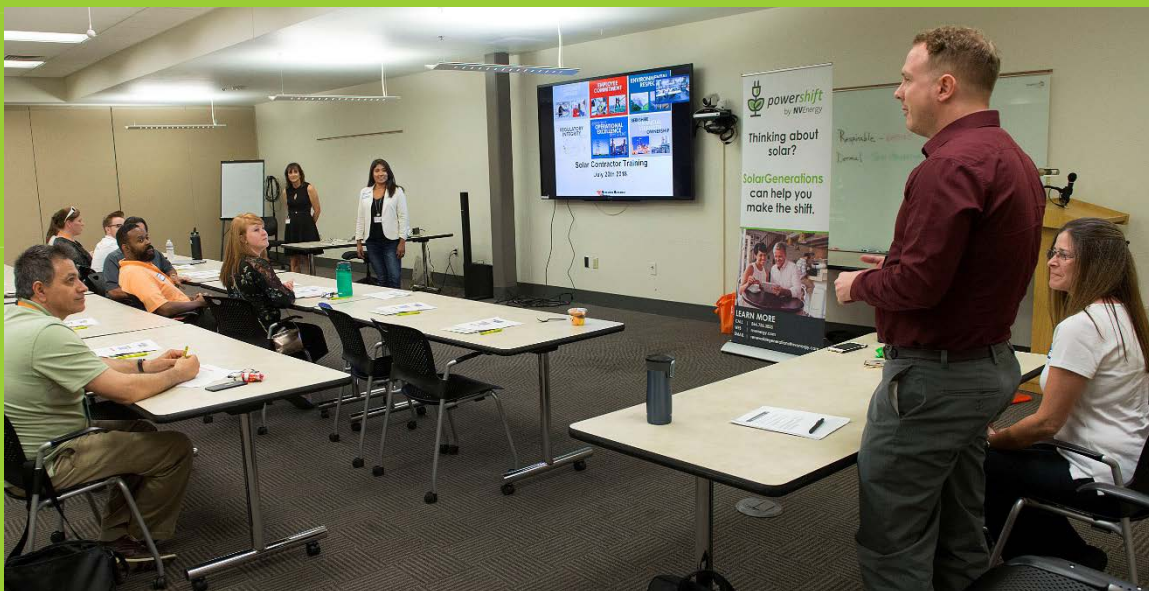
Solar Contractor Training Las Vegas, NV