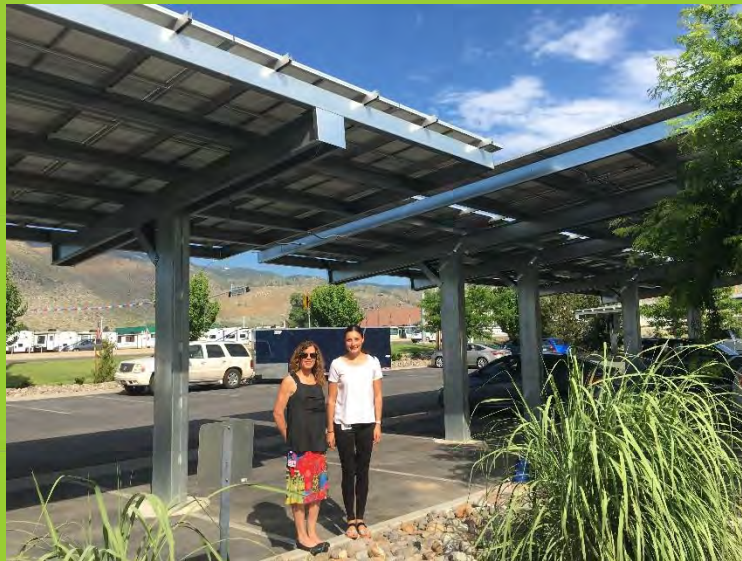
Commercial Solar Installation in Carson City