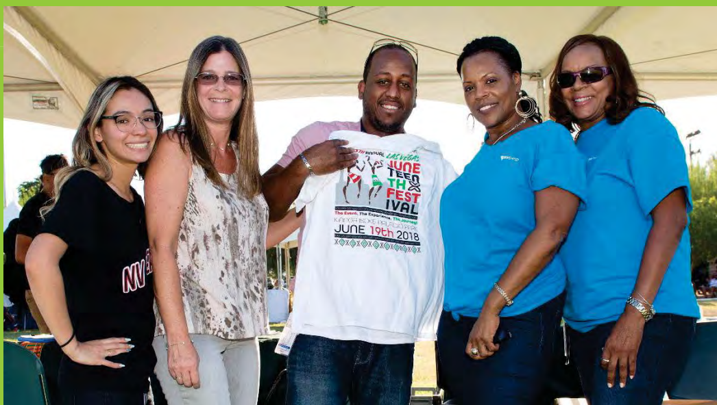
Juneteenth Festival Las Vegas, NV