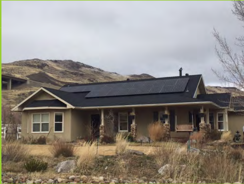
Residential Solar System in Northern Nevada