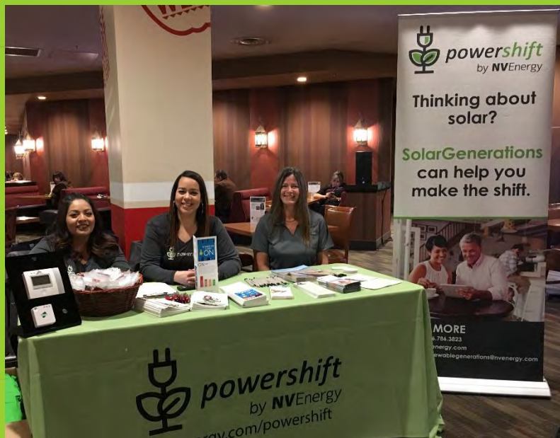
Excalibur Green Fair Las Vegas, NV