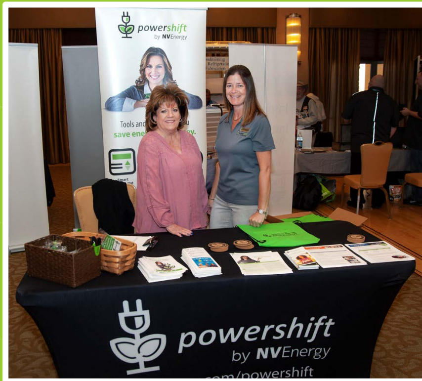
Sun City Anthem Home Expo Las Vegas, NV