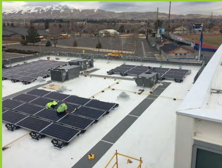
Boys and Girls Club Solar Installation