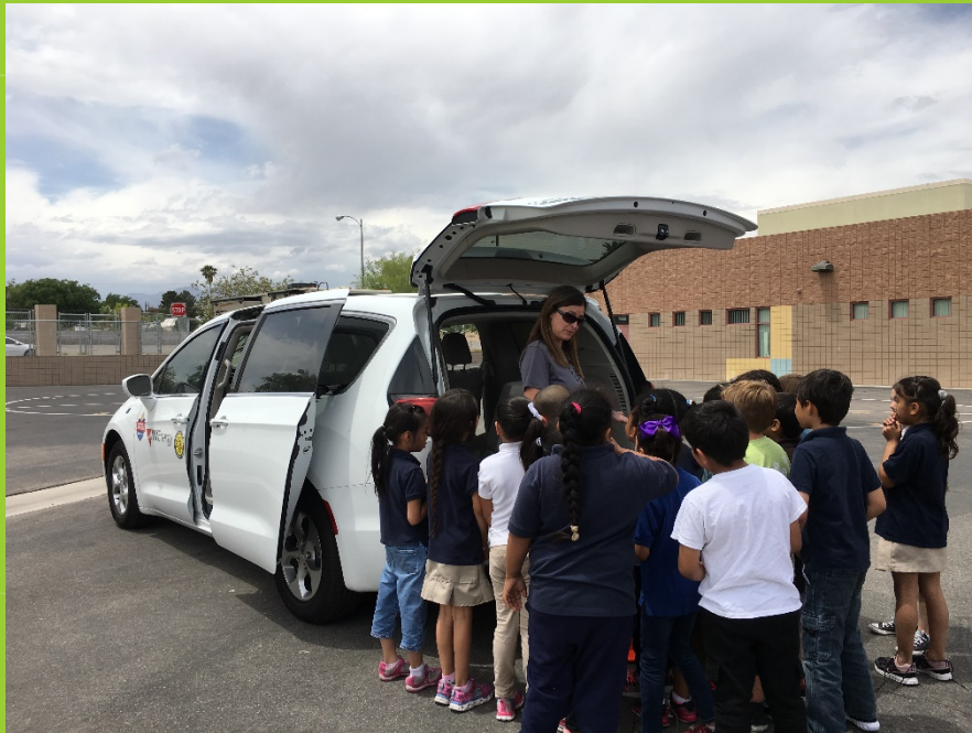
Career Day at Roundy Elementary School Las Vegas, NV