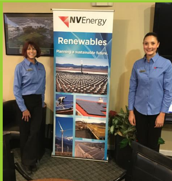
Fernley Chamber of Commerce