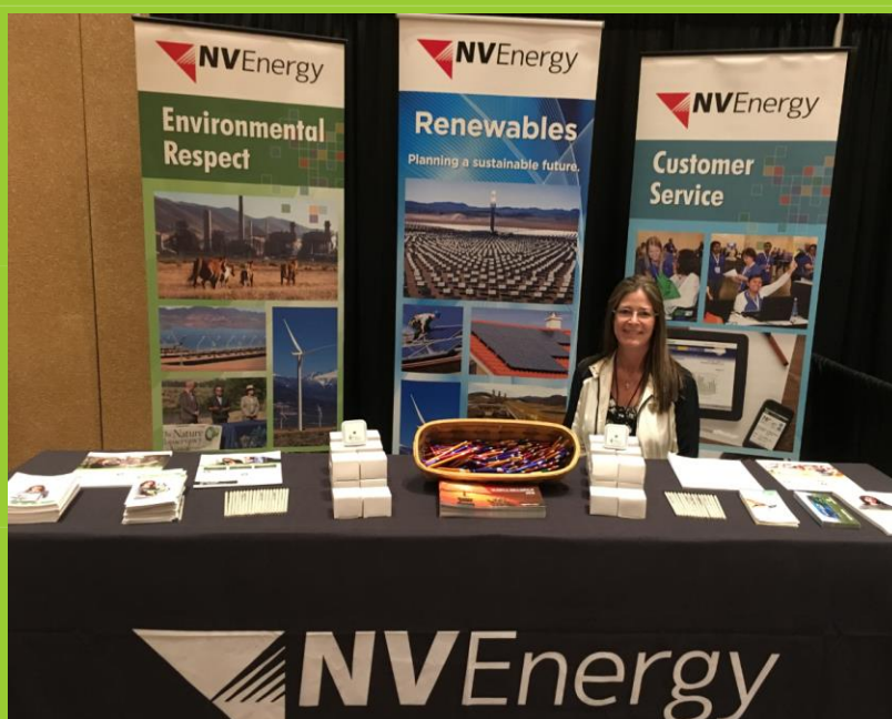
The National Clean Energy Summit, Las Vegas