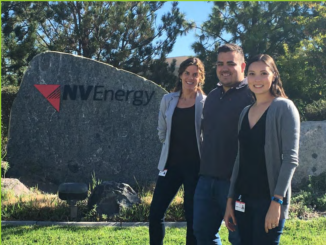
New RenewableGenerations Program Team