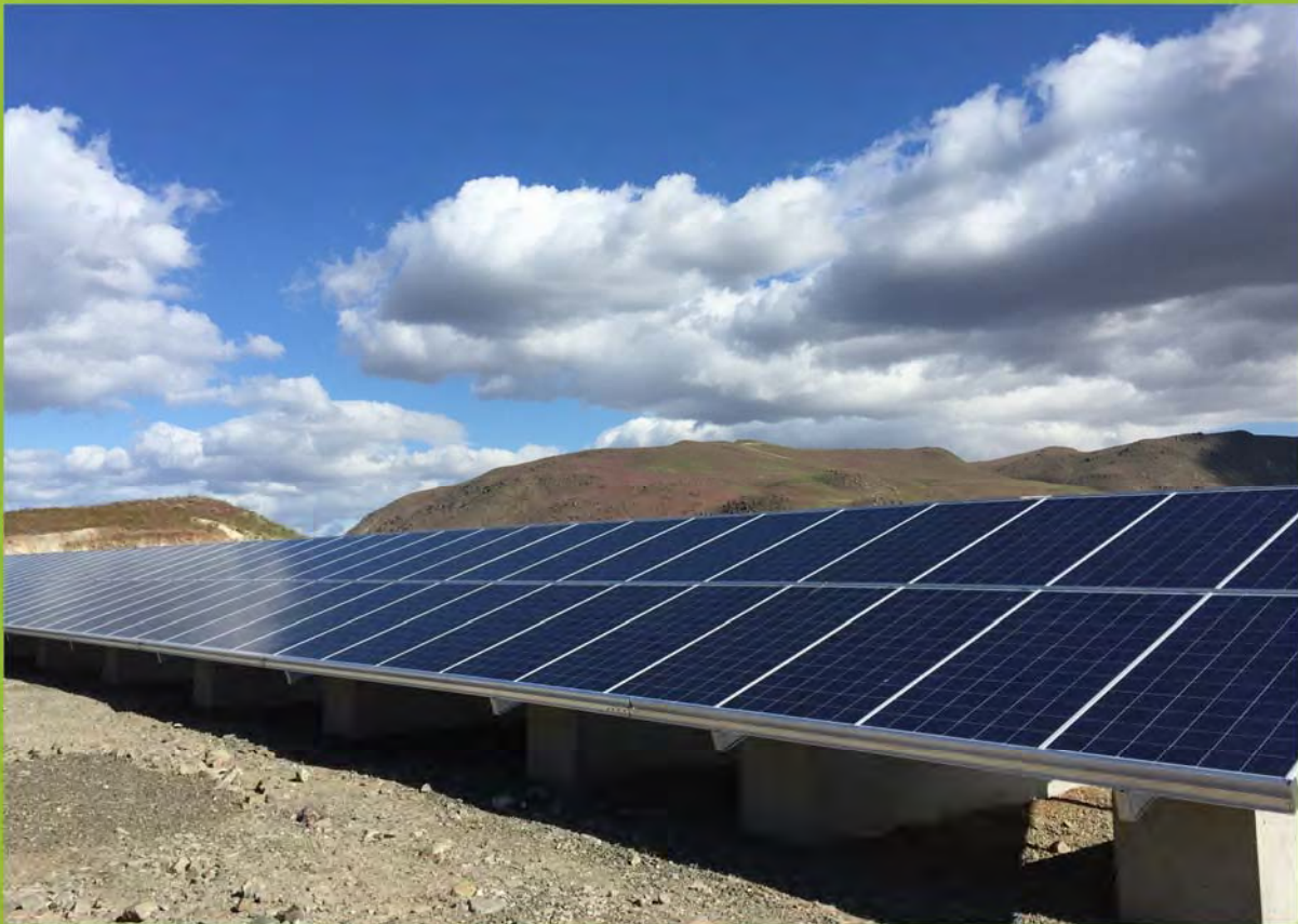
Inspection Photo from Northern Nevada