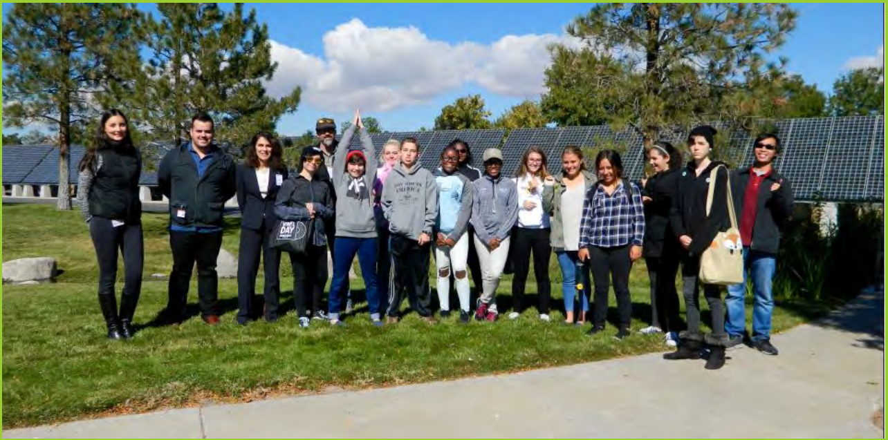
Local Middle and High School Students Tour NV Energy with the RenewableGenerations Team