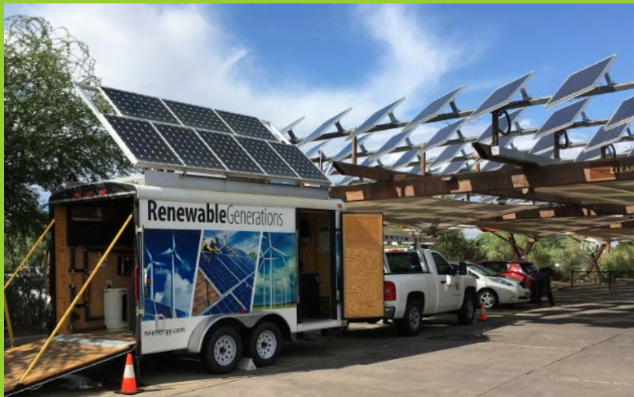
National Drive Electric Week Trailer Demo