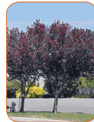
Thundercloud Flowering Plum – Prunus cerasifera

While it is suggested that no tree be planted directly under or adjacent to an electrical power line, the following is a list of low growing trees and shrubs, that a homeowner may find useful in landscaping their yard.