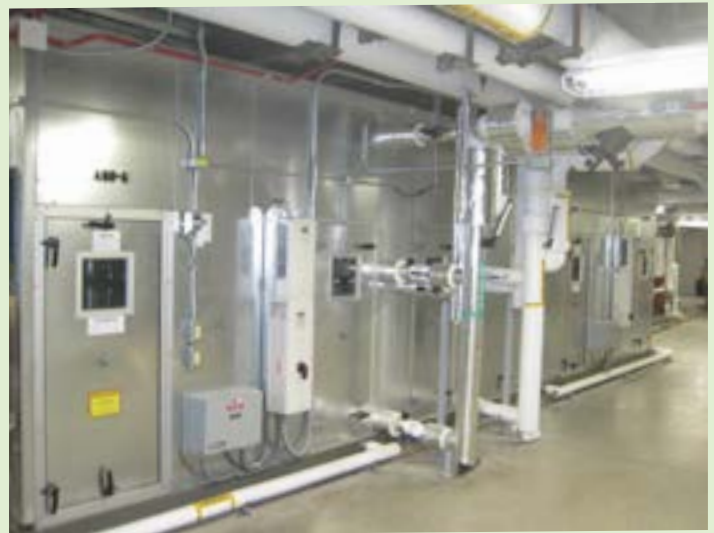
Large handling units benefit from variable speed drives