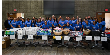
United Way's 10th Annual Day of Caring