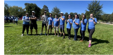
2025 Reno Corporate Challenge Recap