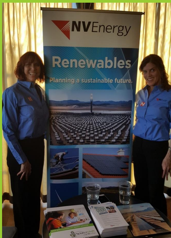
NV Energy RenewableGenerations Staff at an event at the Nevada Museum of Art in Reno