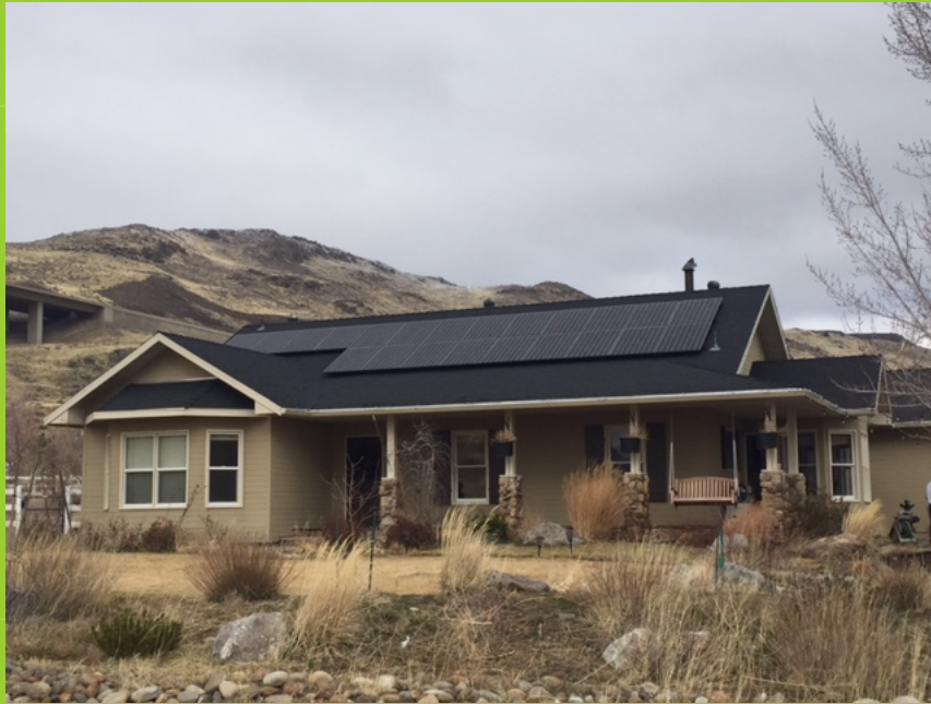
Residential Solar System in Northern Nevada